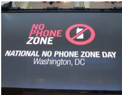
The Oprah Show's No Phone Zone episode was broadcast from D.C. and five other cities.